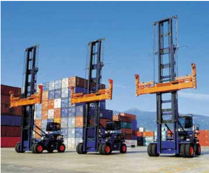
Lift Trucks - Empty Container Handling