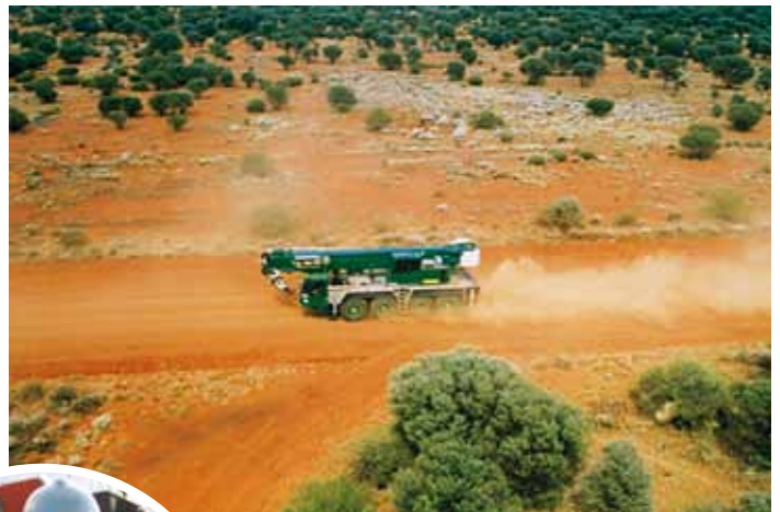
Traveling to rugged jobsites across the Outback