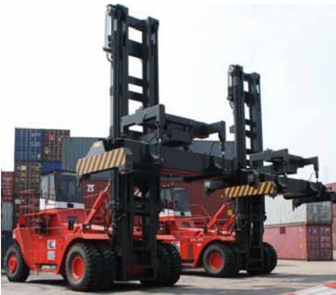
Lift Trucks - Full Container Handling