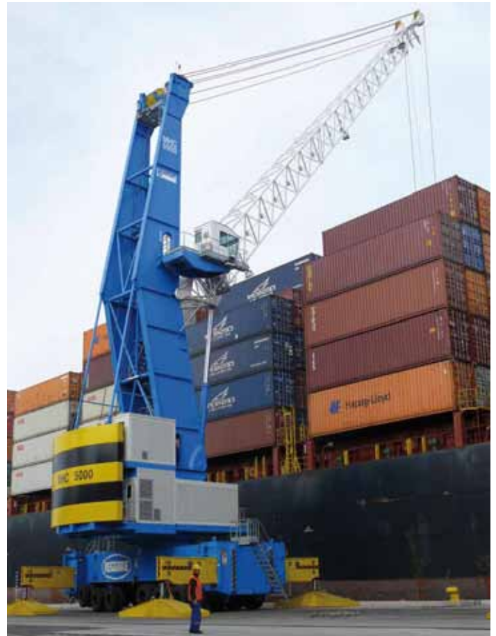
Mobile Harbour Cranes (MHC)