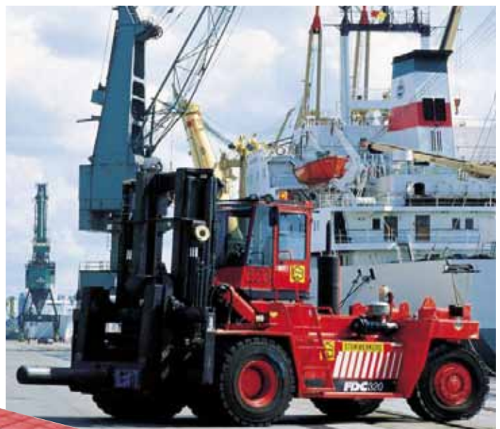
Forklift Trucks - General Cargo Applications