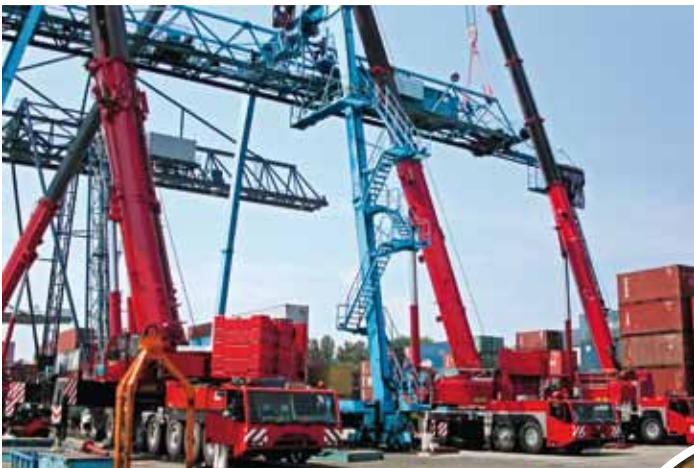
In Germany: A spectacular triple lifting operation