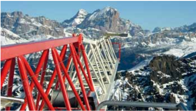
Working at an altitude of 3,000 meters (9,850 ft) in the Alps

Wherever you go and whatever the task, Terex® cranes gives you outstanding performance backed by some of the best cranes experts in the business.