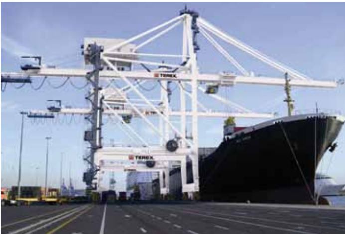
Ship To Shore Crane (STS)