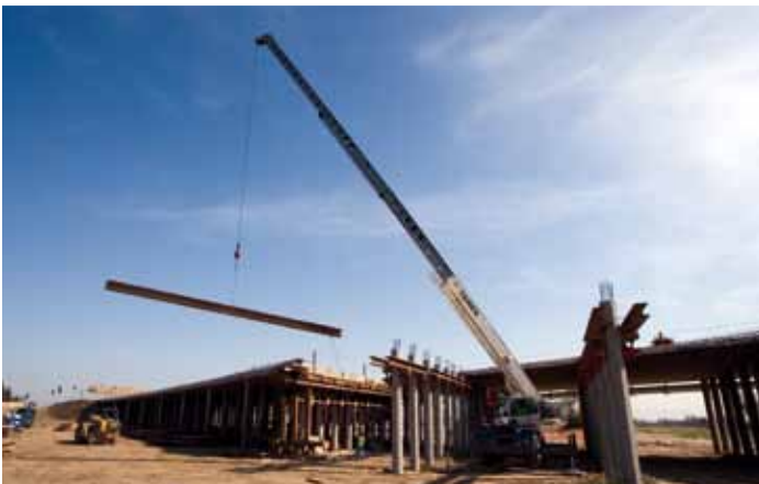
Bridge construction in California, USA