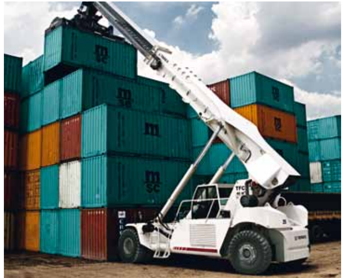
Reach Stackers (RS)